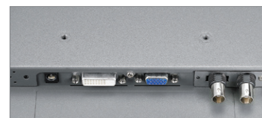
Looping BNC video connector for multiple display connections