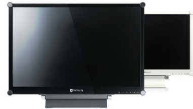
Available in black or white