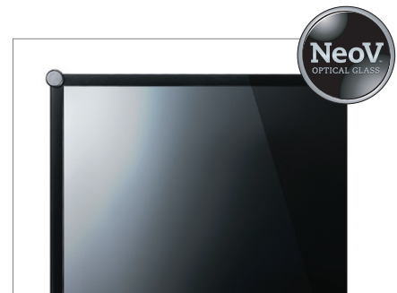
NeoV™ Optical Glass for hard glass protection and strong metal casing for secure mounting